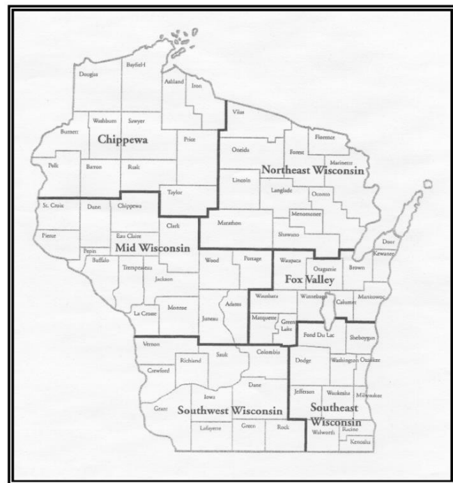
Wisconsin SAF Chapter Map

WI SAF is one of 33 state or multi-state units, and for units with similar membership numbers, WI SAF's chapter configuration is viewed as reasonably typical.